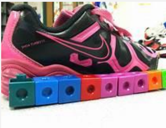
Comparing an item with a cube sticks

In module 3, kindergarten students will begin comparing lengths, weights, and capacity of containers. Toward the end of the module, students will compare actual numerals.